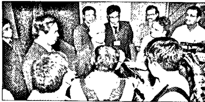
At the conclave on October 30.